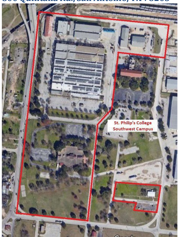
Central Texas Technology Center